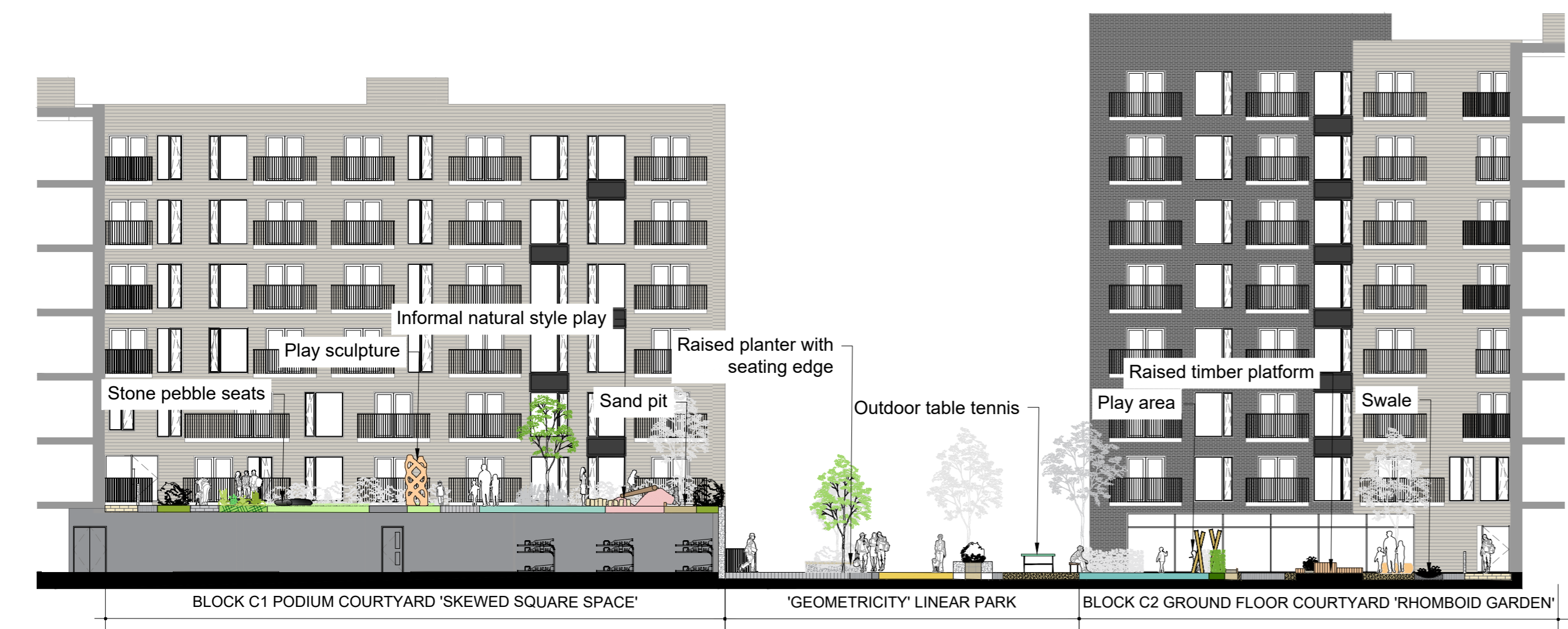
Block C section - scale 1:200

NOTES Floor plan is building 1st floor plan Drawing to be read with the accompanying Landscape Strategy and Design Report 16408-2-001-RevA and Landscape Masterplan drawings 16408-2-100 - 105 and Landscape Masterplan Areas 16408-2-401-406 DRAWING ISSUED FOR PLANNING PURPOSE ONLY. LANDSCAPE IS SUBJECT TO APPROVAL OF THE PLANNING AUTHORITY